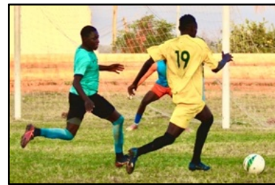
The Annual Livingstone Memorial HIV/ AIDS Prevention Soccer Tournament had 52 teams compete this year.