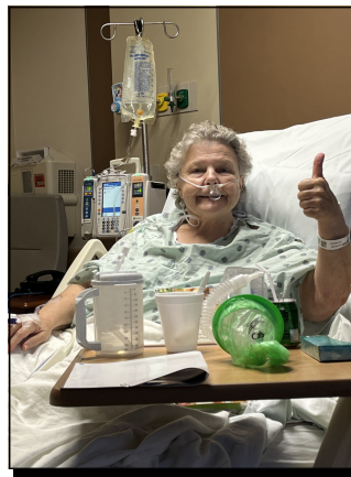
October 24, 2022

Her first knee replacement went very well in October, 2022. They told her she needed both knees done and they would have done the next knee after 90 days.