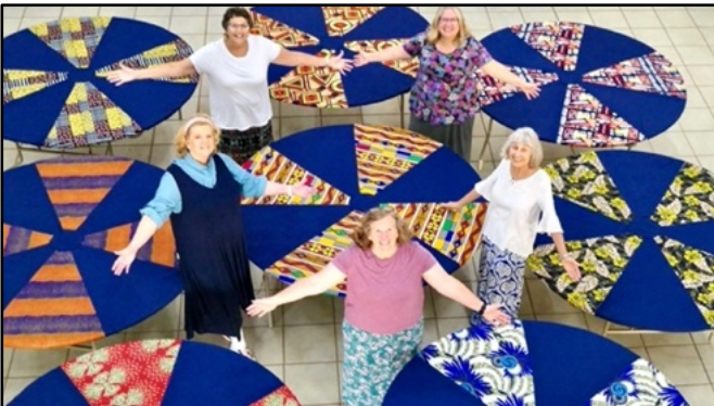
New colorful table clothes for the Community Center. Thank you ladies!