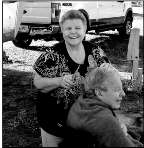
It is time for haircuts.