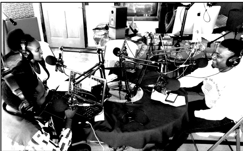
Radio JOY's main studio making programs about the Covid 19 virus. We are the main source of information for the population about this threat.