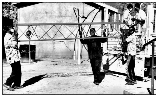
The custom-made tower from Kenya being unloaded at Joy in the Harvest .